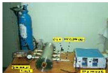
Fig. A.4.1 Ionization Chamber along with the high voltage power supply and ammeter

isolated from the body of the IC. In one of the flanges high voltage feed-through is attached. Voltage up to 3kV is applied through this port. The IC is then filled at desired argon pressure and sealed. For this set of measurements, pure argon gas was filled at pressures between 1.0 and 1.8bar. The IC is first evacuated to a pressure of \sim 10^{-2} mbar, using a rotary pump. The IC current is measured using a Keithly electrometer.