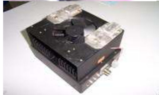
Fig.A.5.2: 20W, 40W and 250W RF power modules