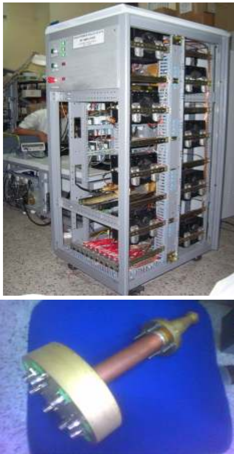
Fig.A.5.1 : High power Solid state RF Amplifier with eight way power combiners/splitters

RF power modules. This module is basic building block of the high power system and operates at RF power gain of 12 dB. 20W and 40W low power driver modules are developed. (Fig.A.5.2). Multiport power divider / combiner was developed indigenously using 1-5/8" rigid line for output port and N connector for input ports. The RF power conversion efficiency of each module is above 60 %. For all power modules, impedance matching network was designed using coaxial transmission line transformer and micro strip transmission line, for getting repeatable performance and sufficient bandwidth. A negative feed back in the output network has been provided to prevent oscillations at low frequency and to obtain stable performance. Complete system operates at 28V DC and is housed in a normal 32U Euro cabinet. TCP/IP interface has been incorporated to monitor the performance remotely.