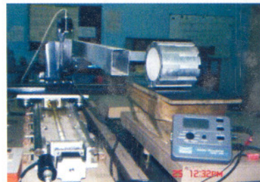
Fig.A.2.3: The experimental set-up to measure the multi-cusp magnetic field using the Hall probe system having 3-D stepper motor control movement for cylindrical plasma chamber used for the H + ion source.

The knowledge of accurate field free region is crucial for H + ion source since it is required for several reasons: (i) the plasma simulation require the knowledge of magnetic field in the central region of plasma chamber, (ii) for the placement of filament or RF antenna and electron filter magnet and proper design of extraction geometry, (iii) the field in the central region affects the cusp loss width, that helps in deciding the power supply requirement, and (iv) it is essential for analyzing the results of plasma diagnostics.