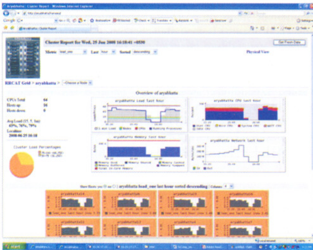
Fig. I.1.1: Typical output of 'Ganglia' showing Load, CPU, Memory and Network usage of Aryabhata cluster.

Consolidated cluster usage in terms of CPU load, Memory and Network is readily available in Ganglia. Also detailed usage of each node of cluster is available in terms of CPU load, Memory, Network, Disk and Packets flow. All these details are available from last one hour to one year in graphical form.