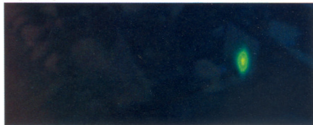
Fig.L.1.1: Laser emission seen on IR viewer card .

Fig.L.1.3 shows the laser emission spectrum clearly displaying the small FWHM value of the cw laser diode.