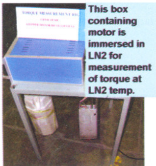
Fig. A.4.1b: The rig with LN 2 box.

The first device (shown in Fig. A.4.1a and Fig. A.4.1b) is based on the principle of torque balance on pulley by dead weight. Here, chain sprocket based mechanism is used to facilitate transfer of torque from the motor in the liquid nitrogen (LN 2 ) immersed chamber to the pulley supported on ball bearings at room temperature. Few