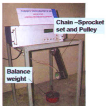
Fig. A.4.1a: Chain sprocket based torque measurement rig.

Stepper motors used for ultrahigh vacuum (UHV) and cryo-temperature applications are generally very expensive and a very limited number of its manufacturers are found worldwide. Moreover, they do not provide the mechanical and electrical parameters of motor like torque at cryo-temperatures. Since cryo-temperature and UHV compatible motors are required for superconducting accelerator development programme of our country, RRCAT is in the process of development of stepper motor for cryo-temperature application. A very important aspect of this development is the measurement of torque of the motor at low temperature. Therefore, a torque measurement rig has been designed, developed and tested at Advanced Accelerator Modules Development Division of RRCAT.