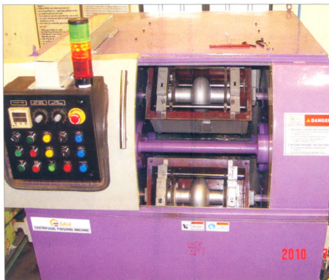
Fig. A.9.1: Barrel polishing machine for Single cell 1.3 GHz SCRF cavity.

Superconducting RF cavities are designed to operate for accelerating gradients of \sim 25 -40 MV/m. The fabrication