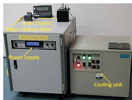
Fig. L.1.2: In-house developed engineered 500 W Yb-doped CW fiber laser.

Reported by: B. N. Upadhyaya (bnand@rrcat.gov.in)