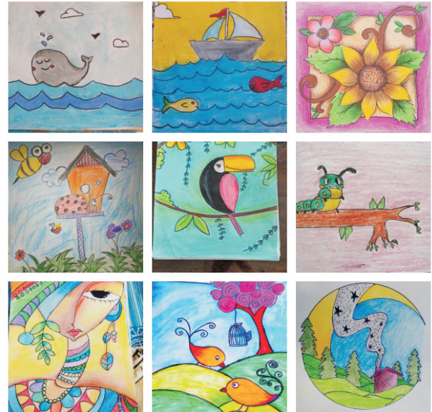
Collage of drawings prepared by wards of RRCAT.

i) Online Summer Classes on Drawing as well as Keyboard were conducted from 20 th April to 19 th May 2020 with ~30 nos. of participation in both the activities.