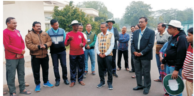
Director, RRCAT (in the middle) interacting with the trek organizers.

Staff Club organized an Annual DAE Trekking Expedition, “Girisanchar-31” during 13 th - 24 th January 2020 in route Kajaligad – Baigram – Kalakund – Kushalgad – Raskundiya – Deogad – Rosayabari – Mahadeo Khodra – Jam Gate & Wanchoo Point in Vindhyaachal range near Indore, Madhya Pradesh. The trail runs mostly in teak forest, valleys, fields situated amid hills, waterfalls and streams of Choral river. The route was picturesque and full of natural beauty. Major attractions of the expedition were Kajaligad, Kushalgad forts, Kalakund heritage train station, Mahadev cave and connecting point of Malwa and Nimar region known as Jam Gate. Six different camp sites were located for the event (Bai Gram, Kalakund, Raskundiya, Rosayabari and Wanchoo Point) with base camp at Lake Side Community Centre, RRCAT Colony. In all 233 participants from 16 different units of DAE reported for the trekking. An outreach activity was also conducted by the volunteers in the nearby villages. It included an interactive session for the local school children and villagers, sky-gazing using telescopes etc.