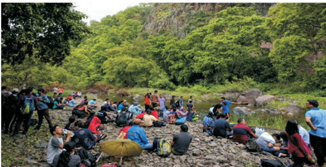
Participants near water stream for trekking to Mehandi Kund.

Two trekking events, one at Mehandi Kund and other at Billa Ghati were organized on 28 th July and 25 th August 2019 respectively, with about 120 participants in each.