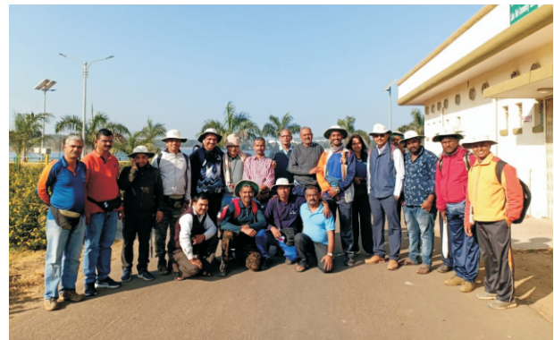
Enthusiastic participants at the base camp.