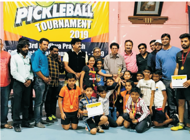
Winners of Pickle Ball overall championship trophy.

Many children of the staff club members participated in 3 rd M.P. State Pickleball tournament organized at Maharaja Yeshwant Rao School, Indore during 10 th - 12 th November 2019 in Sub-Junior category (under 12 years) and Junior category (under 19 years) and won several medals and brought laurels to RRCAT by winning the overall Championship Trophy.