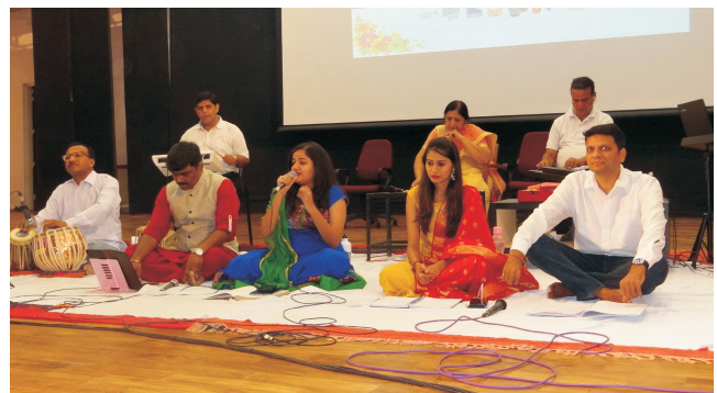
Performers of the cultural group 'उत्कर्ष'.