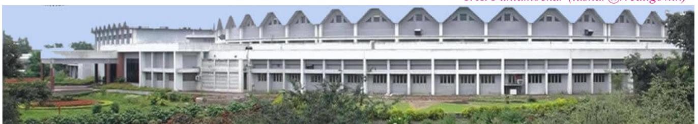
A view of Indus Accelerator Complex.

Reported by: T. A. Puntambekar (tushar@rrcat.gov.in)