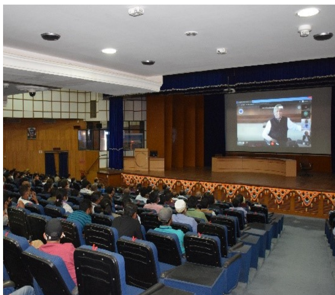
On-line streaming of the proceedings of Foundation Day celebrations in Central Complex.