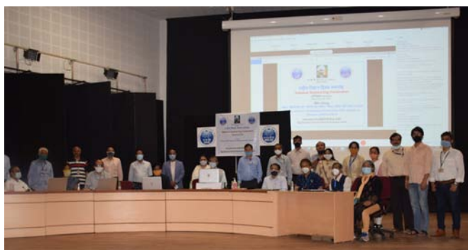
Online program execution team at RRCAT.

The students interacted with the expert panel of RRCAT by communicating their questions through chat box as well as live online interaction. The interaction session of about 90 minutes received overwhelming and enthusiastic response from the students. A separate interactive online session was conducted for about 40 students of special schools for hearing and speech impaired (deaf and mute) students, who interacted with the Director and other experts. They tried to address their queries with the help of interpreter-teachers available at the special school. The students participated actively with wholehearted enthusiasm in this interactive session. A special session of more than 120 minutes for the college students has also been conducted in the afternoon in which about 250 students interacted with the expert panel of RRCAT. The NSD-2021 celebration was highly appreciated by the participants, as was evident from a number of feedback messages received from the teachers and the students.