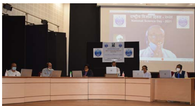
Glimpse of online program abiding the COVID-19 social distancing guidelines.

National Science Day (NSD) is celebrated in India each year on 28 th February to commemorate the discovery of the Raman Effect by Prof. C. V. Raman, who was awarded Nobel Prize in physics in the year 1930 and Bharat Ratna in 1954. Each year RRCAT celebrates the NSD by holding an Open House for the school and college students, teachers, family members and guests of RRCAT staff members, and invitees from the public. However, this year due to the prevailing COVID-19 pandemic situation, RRCAT celebrated NSD in a completely online mode under the theme “Future of Science, Technology and Innovation (STI): Impact on Education, Skills and Work”.