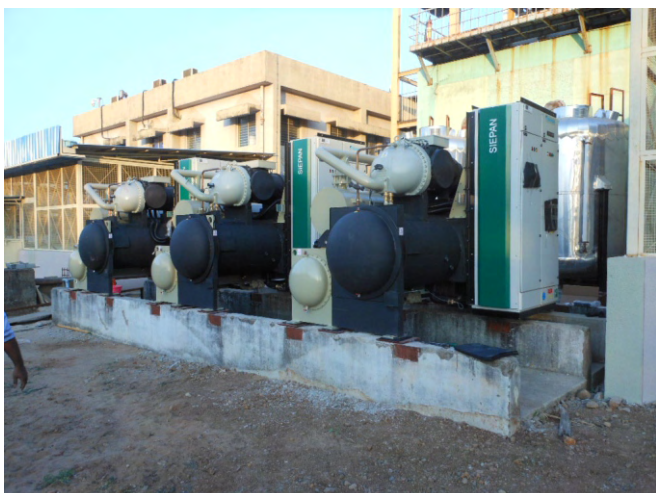
Fig. A.9.2: Three numbers of 180 TR water cooled chillers with electrical panel, instrumentation & controls.

Hence, a new water-cooled, refrigeration based chiller plant was developed and commissioned along with three water-cooled chiller units having flooded type evaporator devices, pumping system, pipelines, heat exchangers, instrumentation & control system as shown in Figures A.9.1 and A.9.2. This provides very fast cooling response for required demand of accelerator machine components. The chiller has shown to achieve 0 to 100% RLA (rated load amps) within 12 minutes. Another aspect of the operational behaviour, achieving temperature control and stability within 26±0.5 °C is shown for one of these chillers in Figure A.9.3.