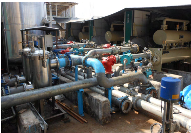
Fig. A.9.1: Developed water cooled chiller plant area with automatic tube cleaning system.

To meet the supply water temperature of 26±0.5 °C in place of 29±1 °C as per the new requirement, it was decided to install and commission a refrigeration based new secondary cooling system in the upgraded chiller plant area as shown in Figure A.9.1.