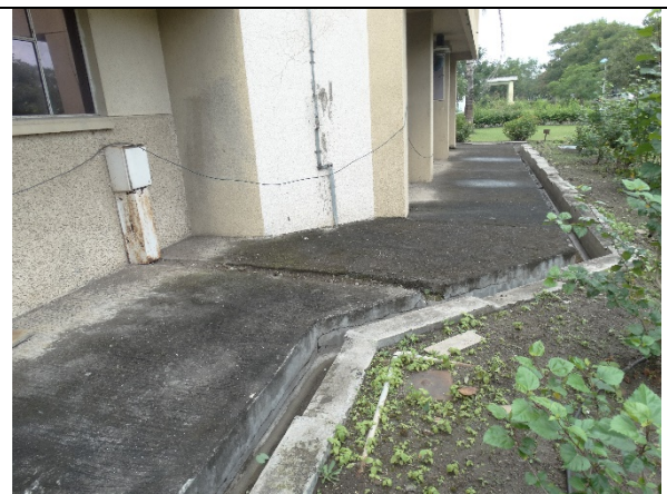
Area to the right side of back door of Block G (before and after cleaning)