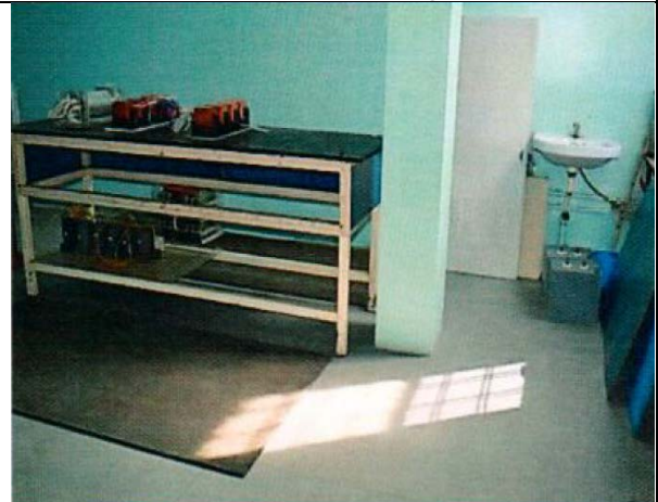
Room No. 118, LPSD, D-Block (before and after cleaning)