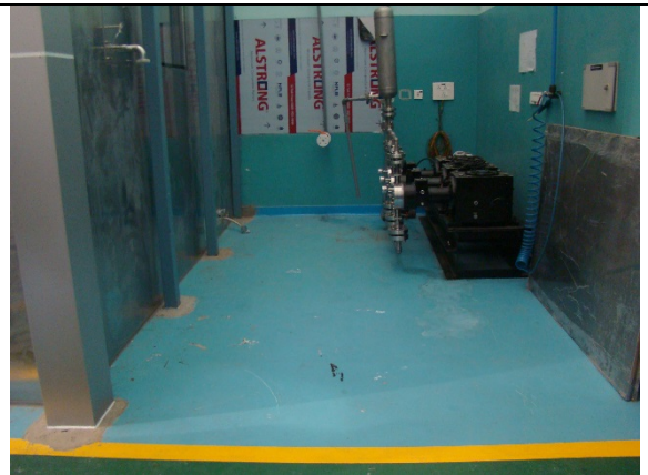
Cavity Processing Lab Building (before and after cleaning)