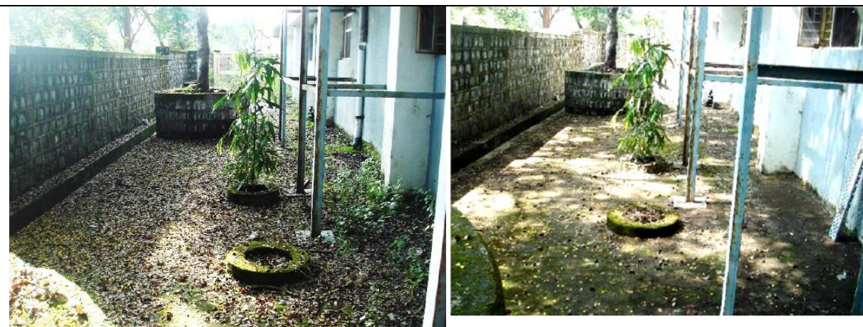
Area around FEL complex (before and after cleaning)

2. ACCELERATOR BEAM PHYSICS SECTION, PROTON ACCELERATOR GROUP