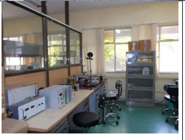
APSD Lab areas before (left) and after (right) cleaning