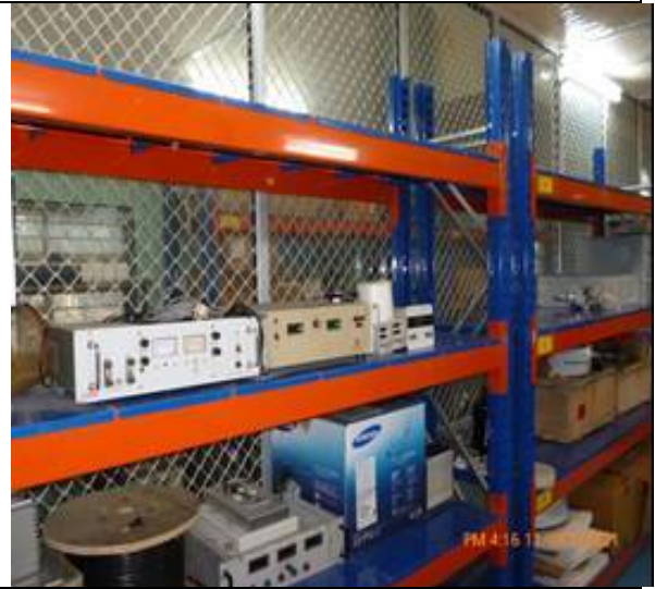
Rack in RF H- Ion Source in H- ion bldg (before and after cleaning)