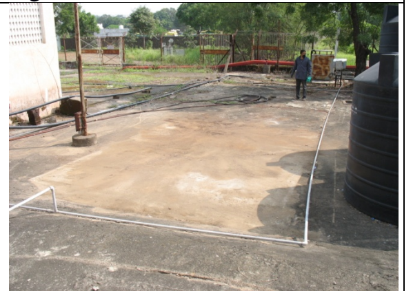
ETP area of the Chemical Treatment Lab of DMTD (before and after cleaning)