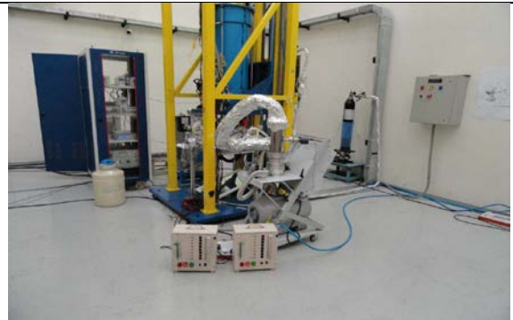
Large coating facility (before and after cleaning)