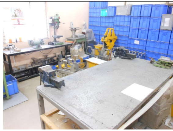
Lab in Room No-G6 (before and after cleaning)