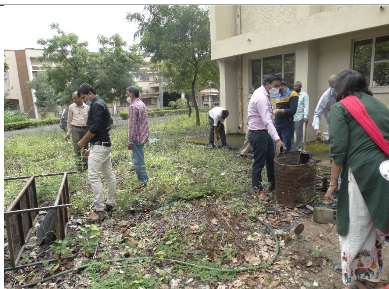
Cleanliness drive in progress in the R&D Block G