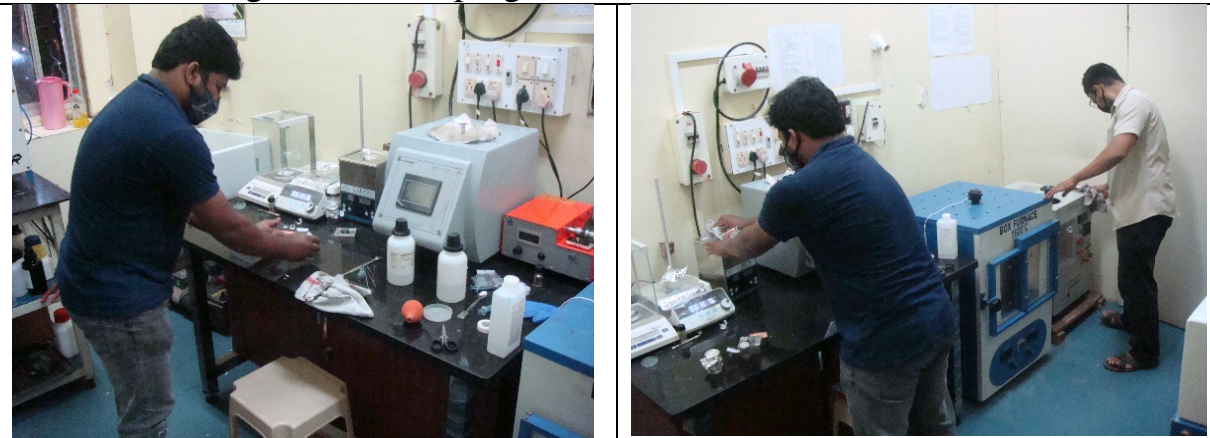
Cleaning work under progress in the Nano-Oxide Electronic Lab