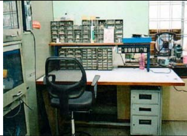
Room No. 12, LPSD, D-Block (before and after cleaning)