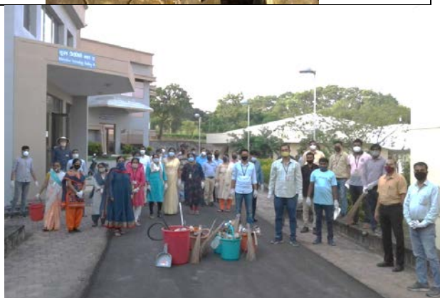
Cleanliness Drive Outside IT Building-A, IT Building-B, IT Building-C and SIRC Building