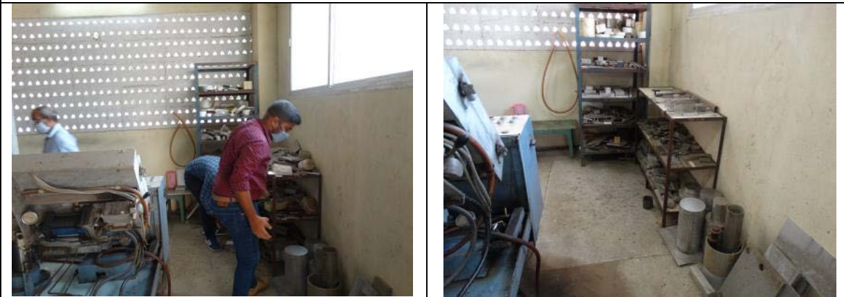
Mechanical workshop storage area before and after cleaning