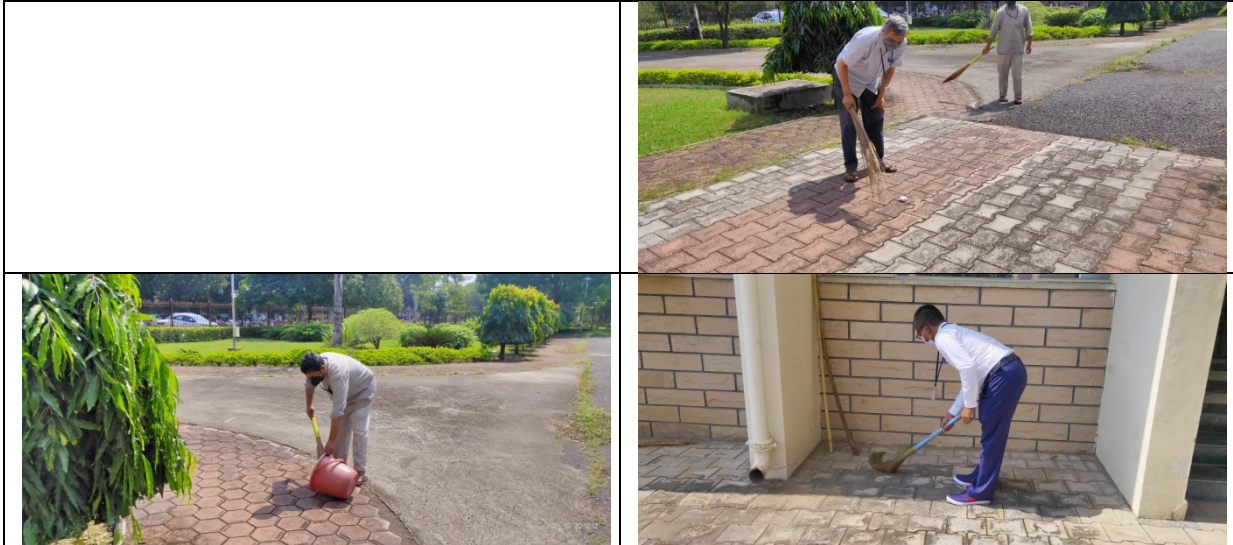
Cleanliness drive in progress at the Training School Bldg. RRCAT