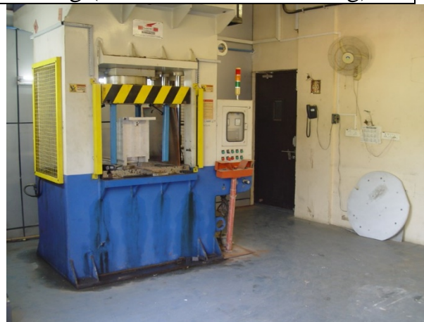
Hydraulic press in SCRF bldg. (before and after cleaning)