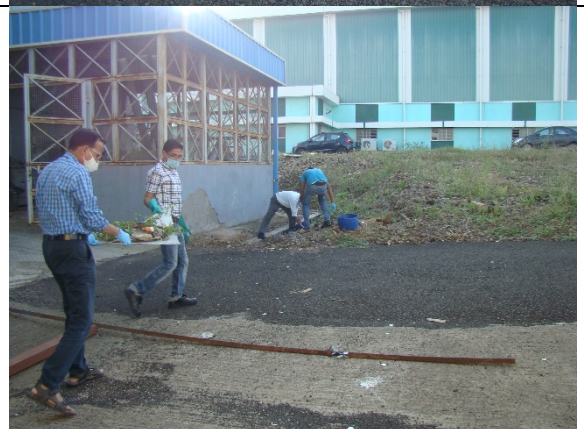
Photographs taken during the cleaning campaign in the SCCCS building