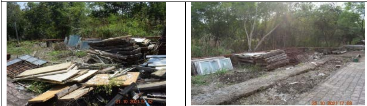
Area around the CSD building, before and after cleaning