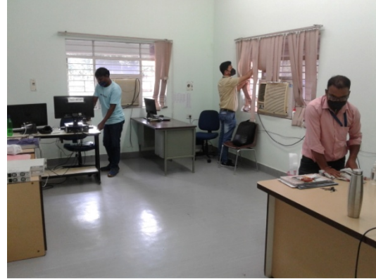
Cleanliness Drive Inside IT Building-A, IT Building-B, IT Building-C and SIRC Building