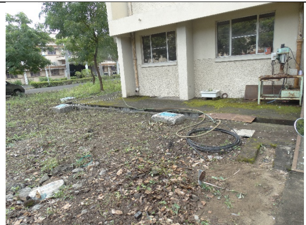
Area near back door of Block G (before and after cleaning)