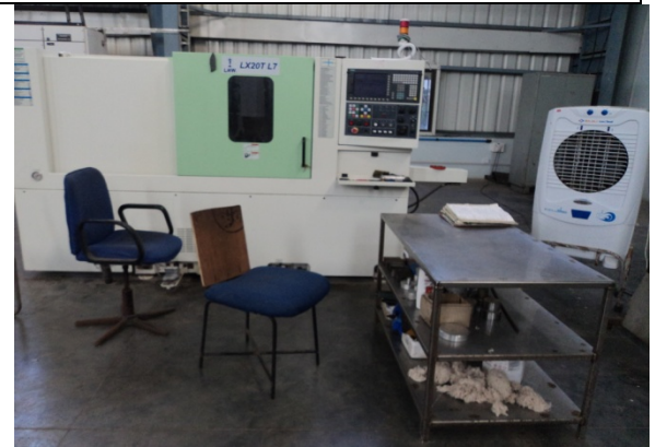
Lathe Machine LX20 (before and after cleaning) in New Fabrication Building of the Planning and Machining Section of DMTD