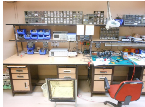
Lab in Room No-F3 (before and after cleaning)