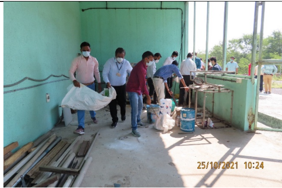
Cleanliness campaign in progress in and around the CDCES building