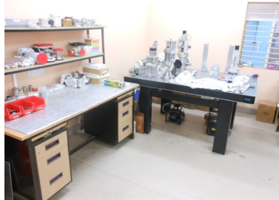
Lab in Room No-G5 (before and after cleaning)