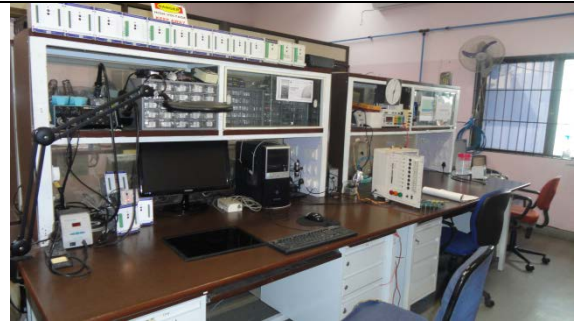
Digital Electronics Lab test bench (before and after cleaning)