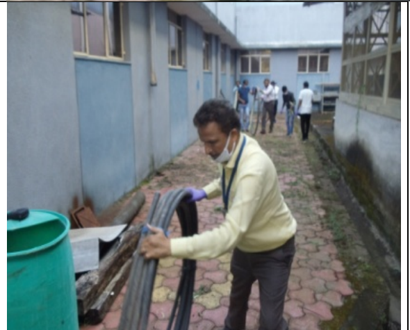
Photographs showing cleaning campaign in & around SCDD building