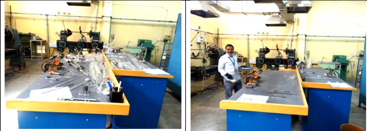
Glass blowing working bench (before and after cleaning)