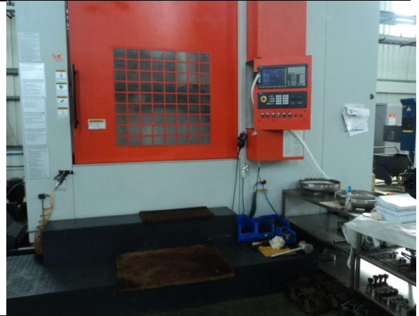
VTL (before and after cleaning) in New fabrication Building of the Planning and Machining Section of DMTD